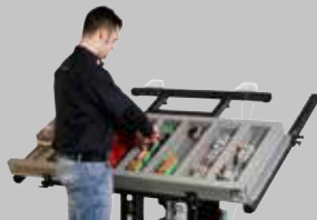
EXTENSION SET Table width extension for horizontal support of mounting panels Prod.-No. 03100-001